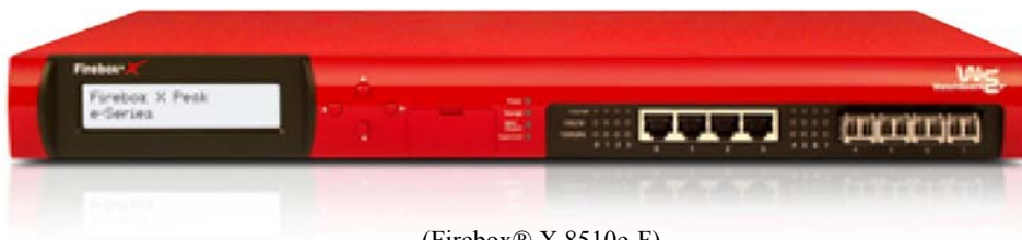
(Firebox® X 8510e-F)

We are showcasing the newly-released Firebox X Edge models, the newly-released Firebox E series firewalls, the latest version of the management software called "Fireware", and the SSL-VPN appliances!